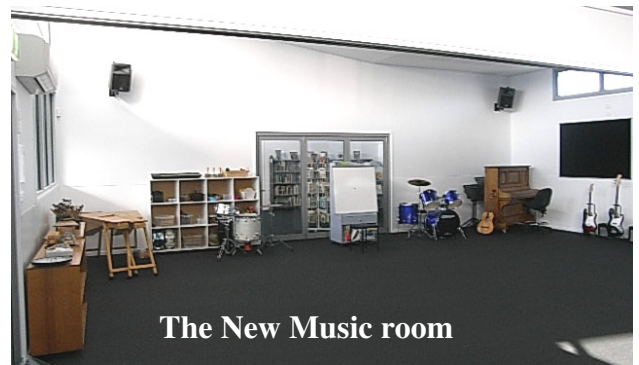
The New Music room