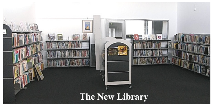
The New Library